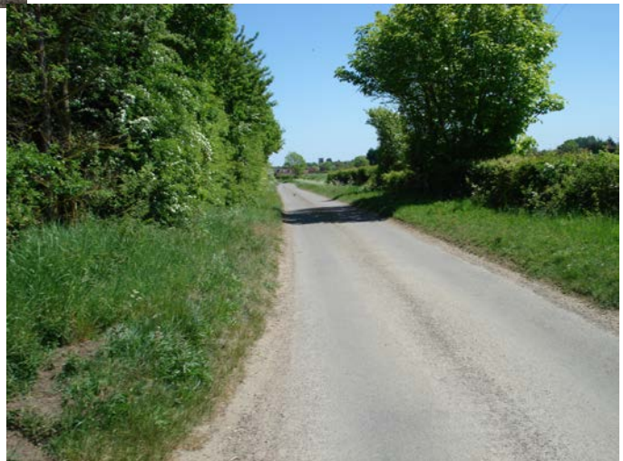
View along road from pylon