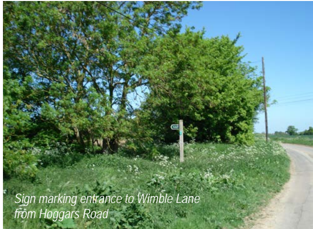
Sign marking entrance to Wimble Lane from Hoggars Road

Turn right along Hoggars Road and then turn immediately left at the footpath sign into Wimble Lane. (This is right of way 1 on definitive map).