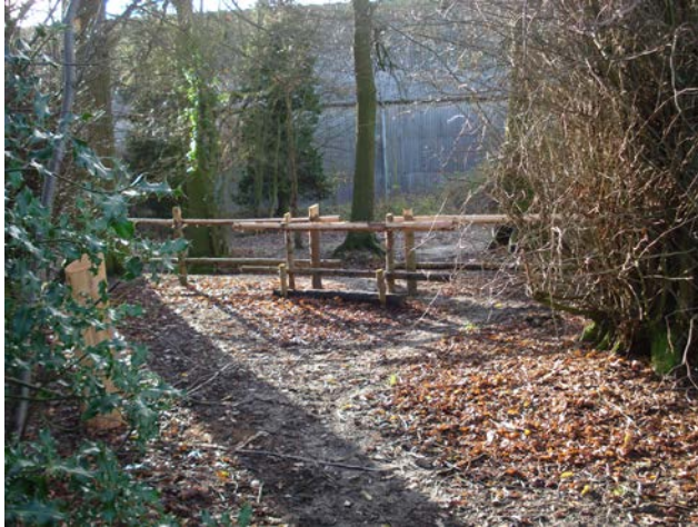
Exit from Vicarage Plantation through parallel fencing (B)

Exit the plantation (B) through the parallel fencing and across a ditch opposite the grain store. Turn right. (This is right of way 61 on definitive map).