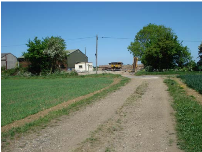
Junction of Potter's Lane with Cotton Road (J)