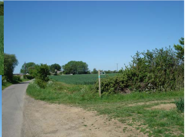
Signpost at corner of Elden's Lane (H)