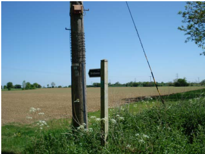
Bridleway sign next to Wicke's Farm