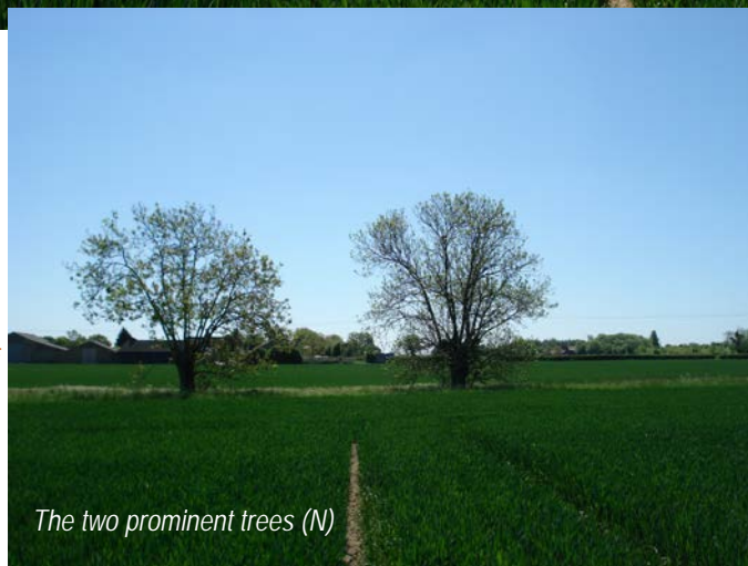
The two prominent trees (N)

When last walked, the footpath had not been restored across the field. It was possible to walk the central part of the field, in the approximate line of the path by following tractor tracks.