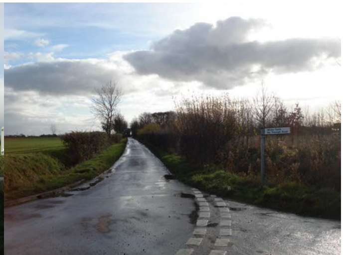
Junction with Hoggars Road