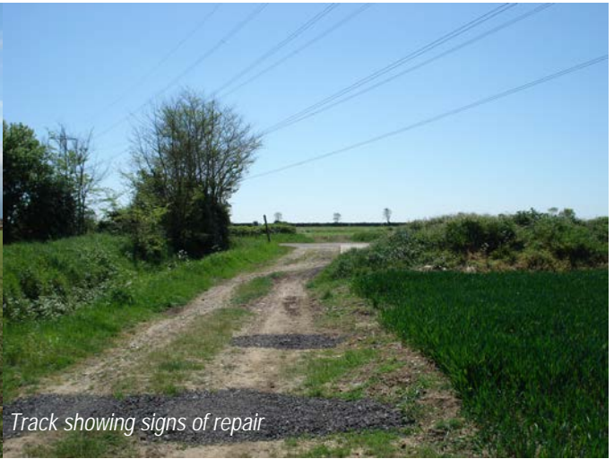
Track showing signs of repair

Join the road at the pylon and turn left.