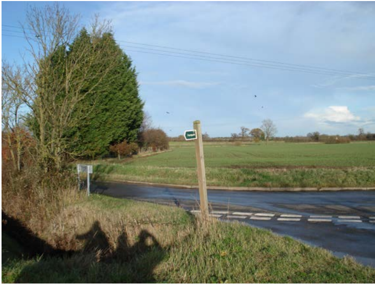
Sign marking junction of footpath with Mill Road (Q)

You then reach the road (corner of Mill Road and Hobbies Lane) (Q).