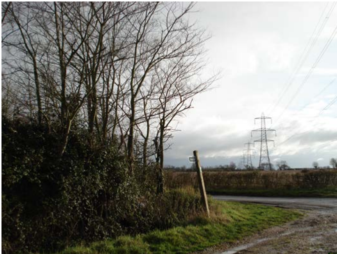
Footpath sign at junction with road (O)

Join the road at the pylon and turn left.