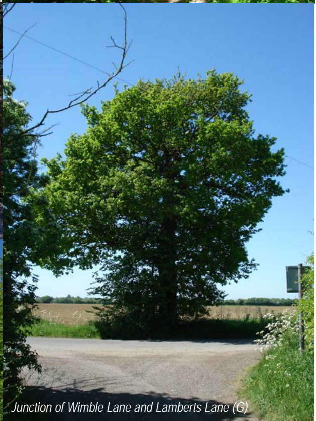
Junction of Wimble Lane and Lamberts Lane (G)

Proceed to where Wimble Lane meets the road (Lamberts Lane) (G) You pass an isolated cottage on your left. Wimble Lane becomes metalled just before reaching Lamberts Lane.