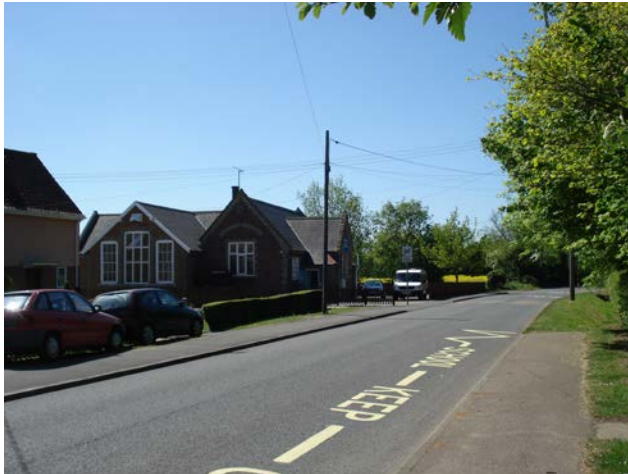
View from school towards Vicarage Plantation – St Joseph's on left

Start at Mendlesham Community Centre car park (START). Turn right out of the car park along the road away from the village, passing St Joseph's centre on your left. Initially walk along the grass verge and then join the footpath to the vicarage plantation.