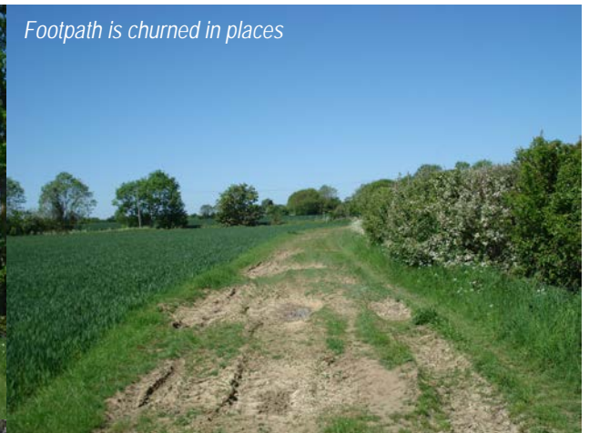
Footpath is churned in places