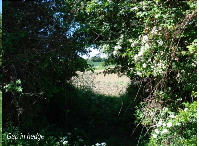
Gap in hedge