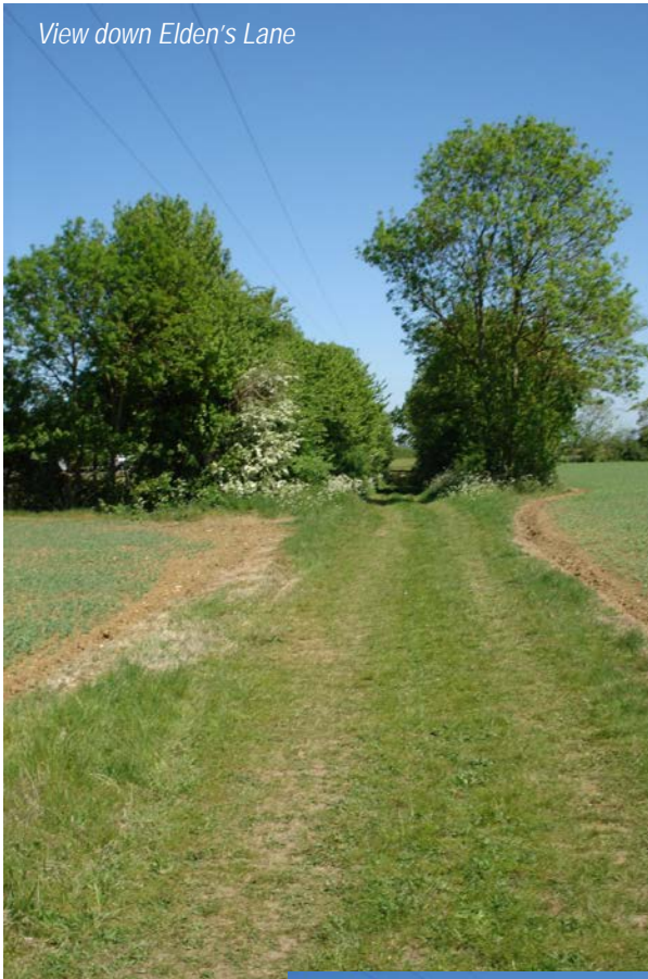
View down Elden's Lane

Proceed straight ahead along Potter's Lane.