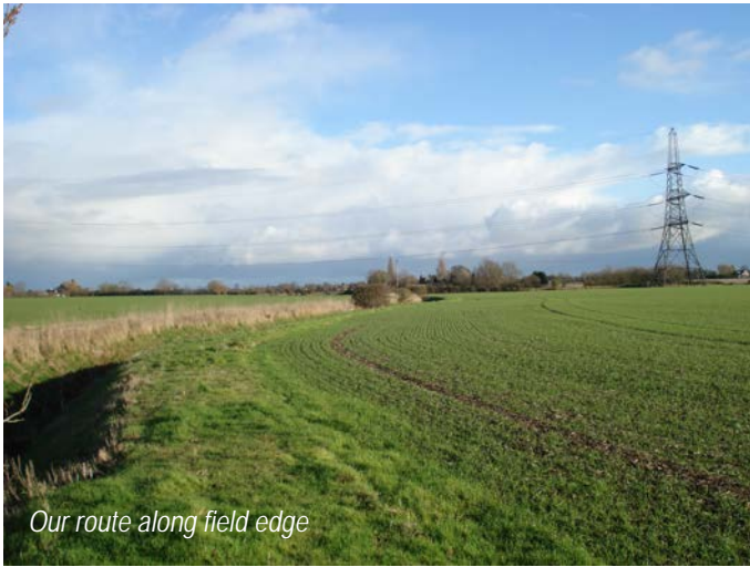
Our route along field edge