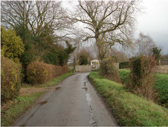
View towards road junction