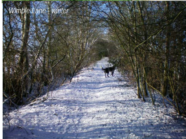
Wimble Lane - winter