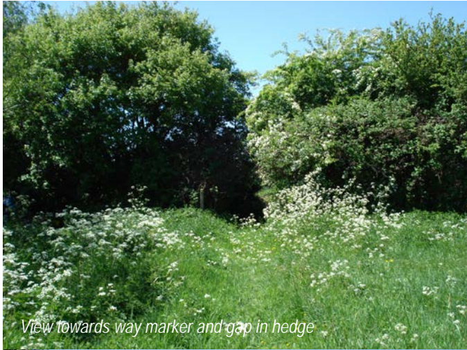
View towards way marker and gap in hedge