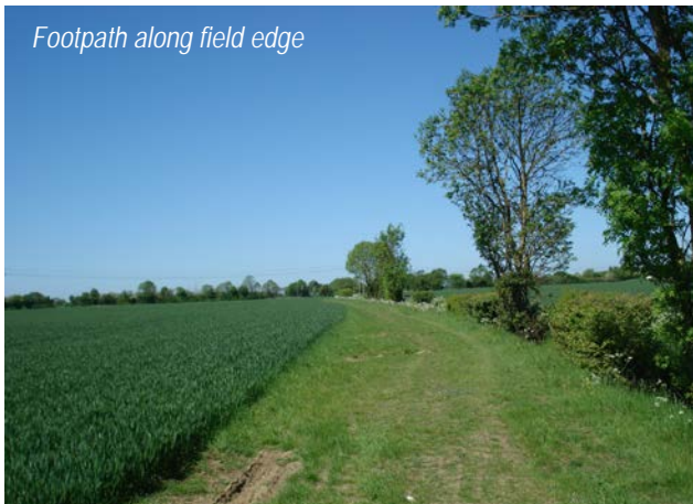
Footpath along field edge

At the oak tree (E), continue along the side of the field to the road (Hoggars Road) (F).