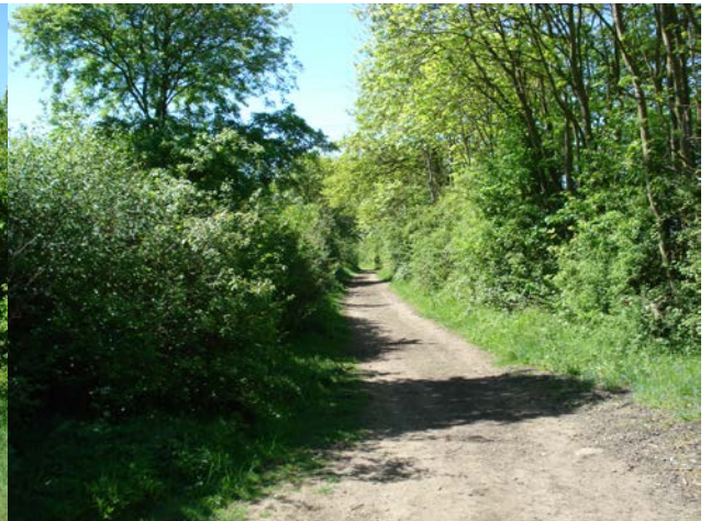
View up Whiteup's Lane from sign

There is an excellent sign here. However, if you approach from the north, there is no way marker pointing down right of way 61 towards the grain store.