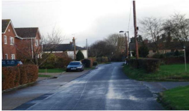
View down Mill Road into village

On reaching the corner by old public house (previously The Fleece) (R) turn right and return to the car park. Alternatively you may wish to turn left and then right to find your way to the Kings Head Pub for a rewarding refreshment