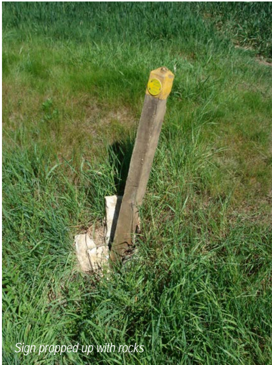
Sign propped up with rocks

You will see a way marker for the old Middle Suffolk Railway if you choose to walk around the field edge as described on page 5 OR turn left at this point and walk along the grass track. NOTE: is not a formal public right of way.