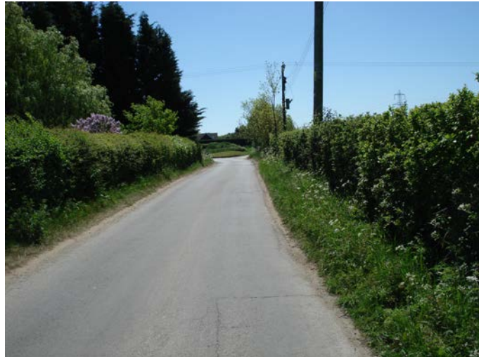
View at road junction towards Hobbies Lane

On reaching the corner of Mill Road and Hobbies Lane (Q) turn left. It is at this point that we join up with the Shorter route on page 22 (the Shorter route starting at point I on page 9)