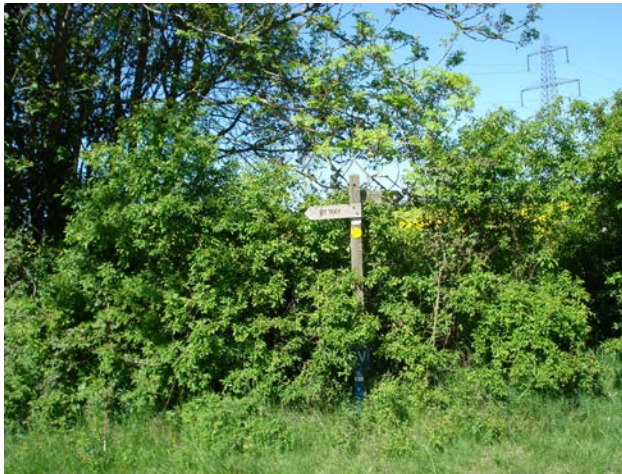
Sign at junction with Whiteup's Lane (C)

At the end of the track (C) turn left onto Whiteup's Lane. There is a wooden footpath sign at this point (This is right of way 62 on definitive map).