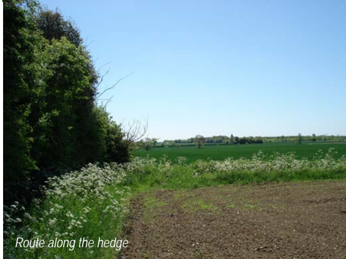
Route along the hedge

You have to get quite close to Lodge Cottage and the way marker is probably only visible if you are looking for it