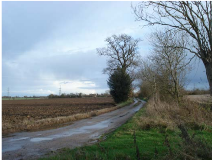
View along road from Elden's Lane Farm

Turn right along the road instead of going up on to the track by Wick's Farm