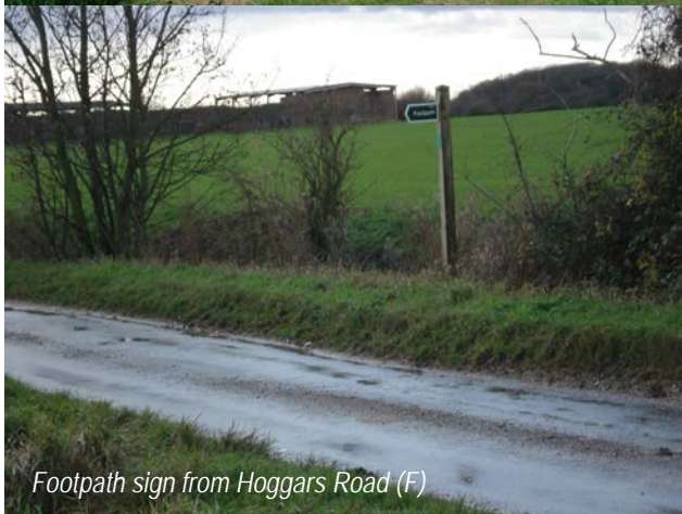
Footpath sign from Hoggars Road (F)

The footpath along the side of this field is badly churned in places and can be muddy in wet weather. The current route of the footpath (47) does not exit onto Hoggars Road at the place of the sign, but slightly to the right.