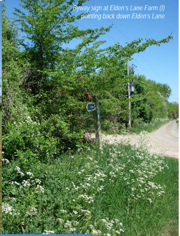
Byway sign at Elden's Lane Farm (I) pointing back down Elden's Lane