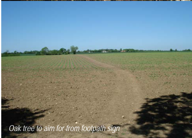
Oak tree to aim for from footpath sign

At this oak tree, the sign has often fallen over and may be propped up with rocks or resting against the tree!