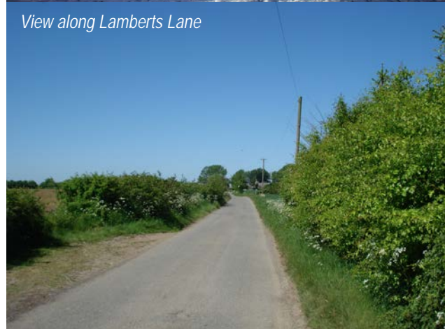
View along Lamberts Lane