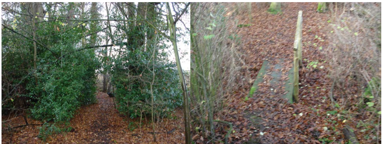
Woodland walk around Vicarage Plantation – showing one of the wooden bridges