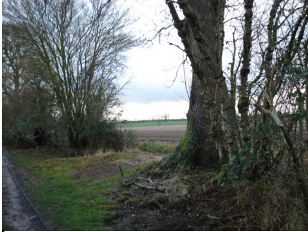
Oak tree obscuring footpath sign (D)

Just after passing under the overhead electricity wires (D) turn right across the field. There is a footpath sign behind the large oak tree. Head for the solitary oak tree at the end of the hedge. (This is right of way 47 on definitive map).