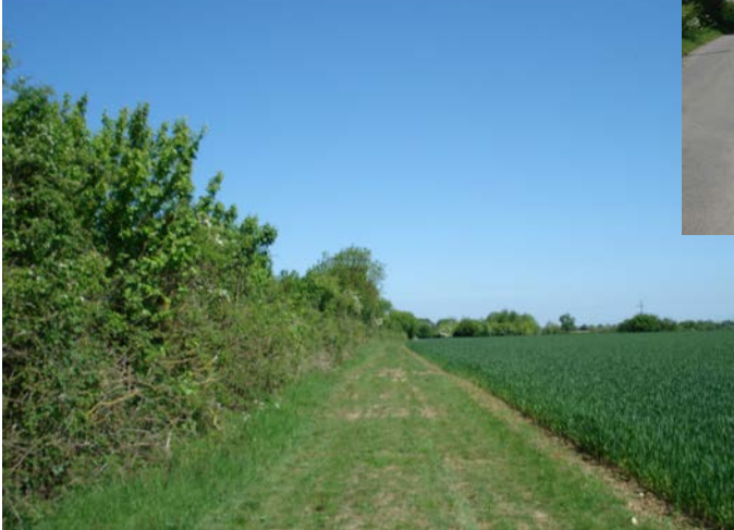
View along Elden's Lane