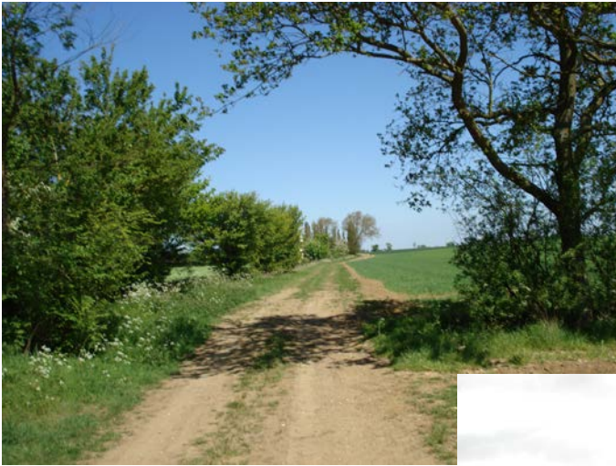
Views along Potter's Lane bridleway

The bridleway is badly-churned in places and is muddy in wet weather