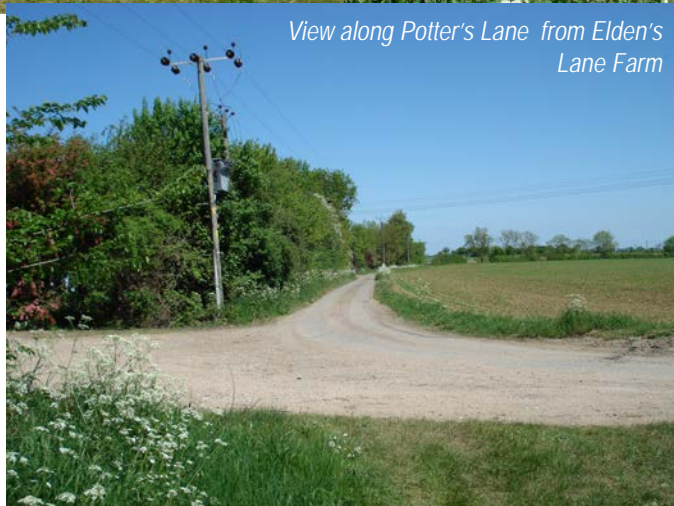
View along Potter's Lane from Elden's Lane Farm