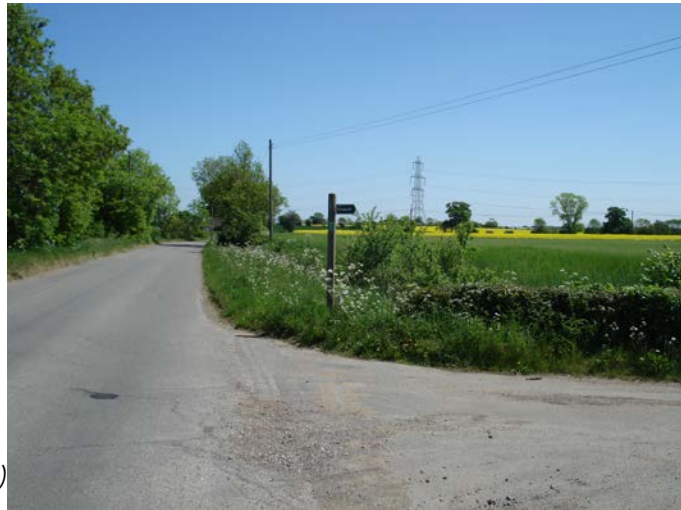
Footpath sign marking turn off Cotton Road (K)

From Cotton Road, the footpath follows a private road which is labelled 'Lodge Farm – Private'.