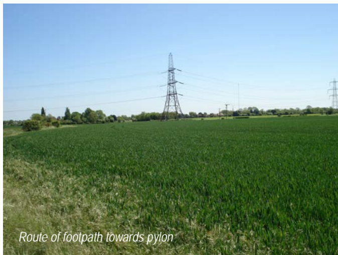
Route of footpath towards pylon

Cross the bridge into the next field. From here, the footpath goes directly towards the closest electricity pylon (O) (this is right of way 54)