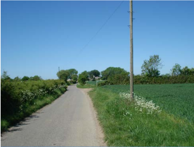
View along Lamberts Lane to junction with Elden's Lane

Turn right. Proceed to Elden's Lane (H) Turn right onto Elden's Lane which appears like a grass track. (This is right of way 59 on definitive map).