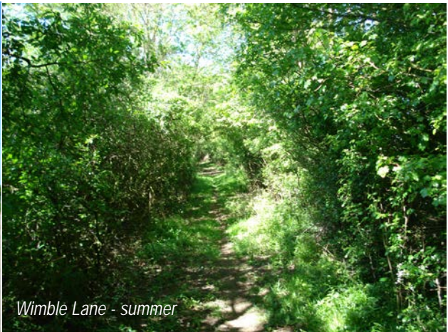
Wimble Lane - summer