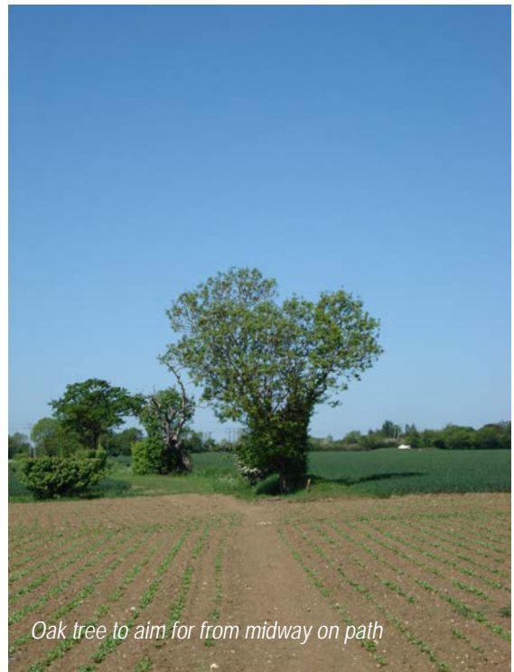
Oak tree to aim for from midway on path