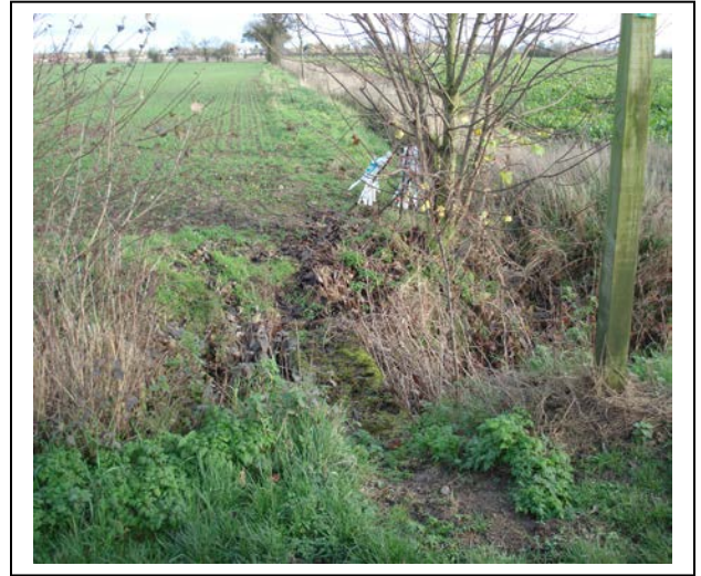
Bridge giving access to footpath

Turn left and take the footpath. From the road, the footpath proceeds for a short distance along the field edge before heading diagonally across the field towards Mendlesham Hall. Access is gained to the next field by a small footbridge.