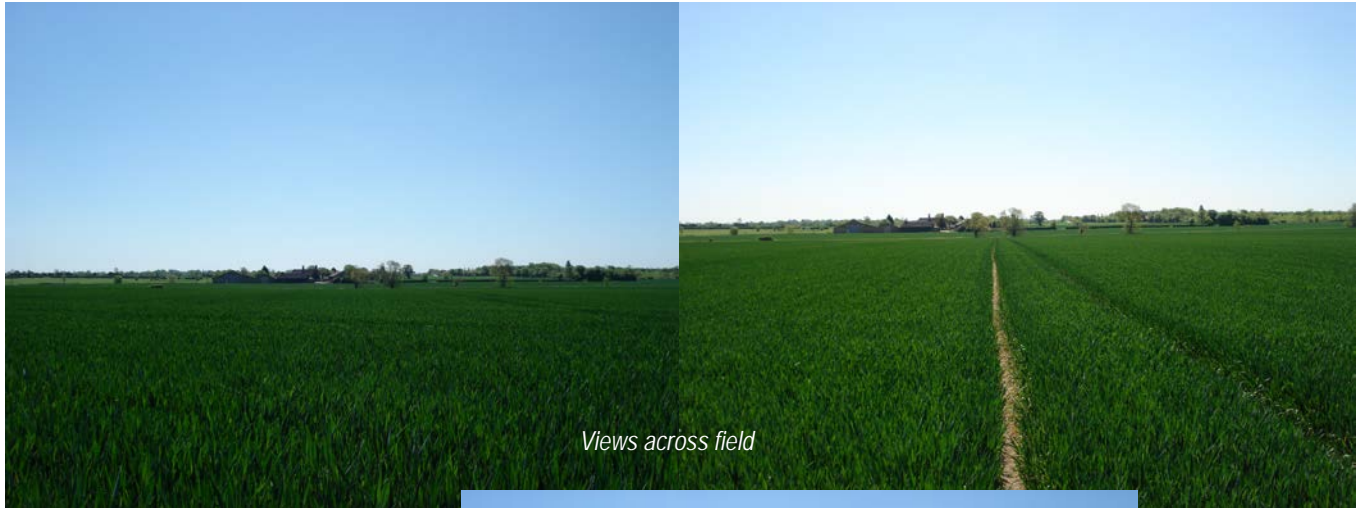
Views across field

Follow the line of the hedge across the field aiming for two prominent trees at the field edge (N) where you will see a bridge across the ditch.