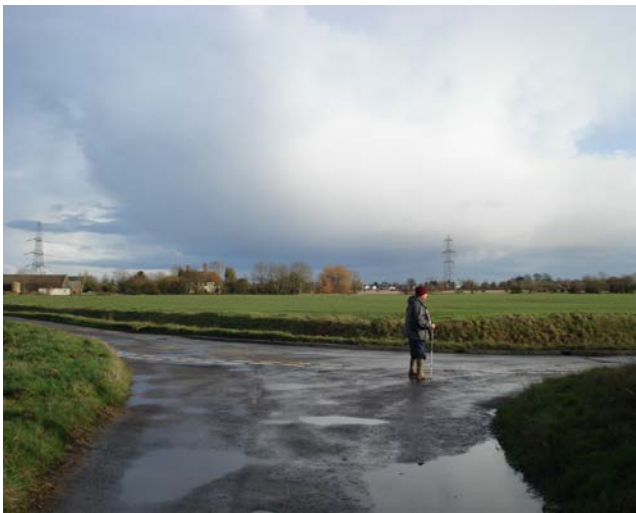
Turn from road onto Hoggars Road (1)

Proceed along the road until you reach the junction with Hoggars Road (1). There is a sign pointing in the direction from which you have come which says 'Wicks's Farm. No Through Road'. Turn right.