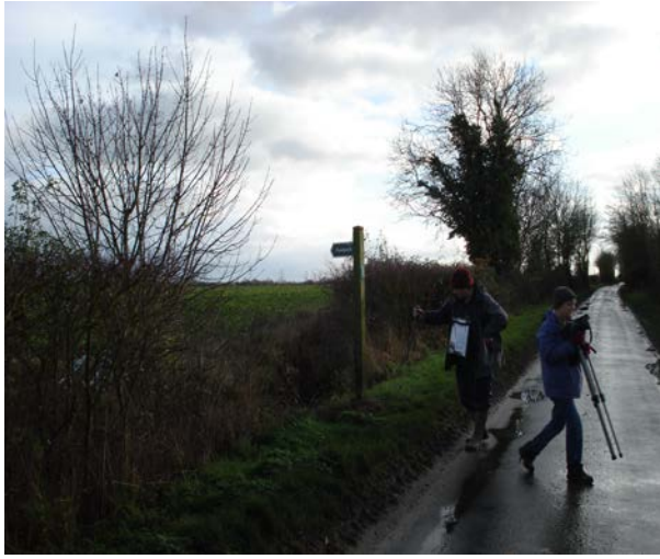
Footpath sign leaving Hoggars Road (2)

Proceed along the road until you a footpath sign on your left (2). (This is right of way 53 on definitive map).