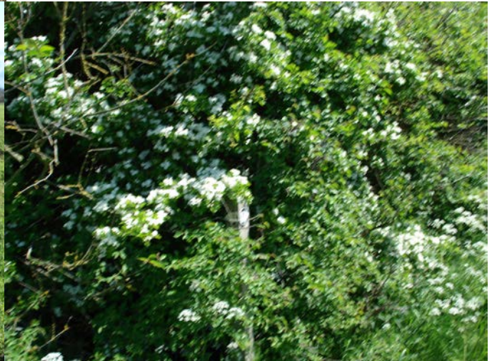
Way marker at the hedge corner – winter and summer

The way marker is fairly embedded in the hedge. When well-cut, this is visible but not when the hedge is overgrown. The marker points along the field edge which is not the route of the path, according to the definitive map, it is across the field. Follow the space between crops if a pathway is not clear.