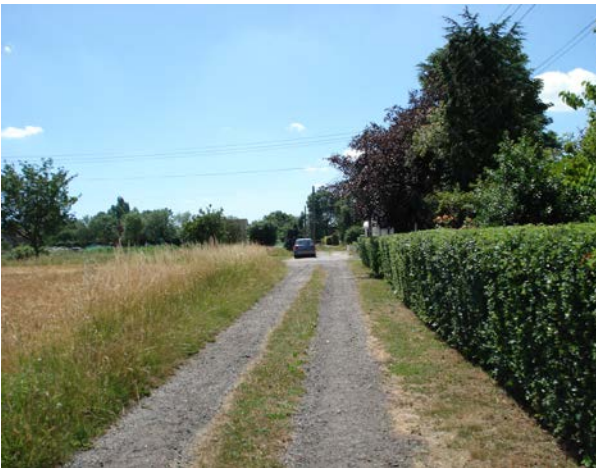
Track heading back to Mendlesham Green