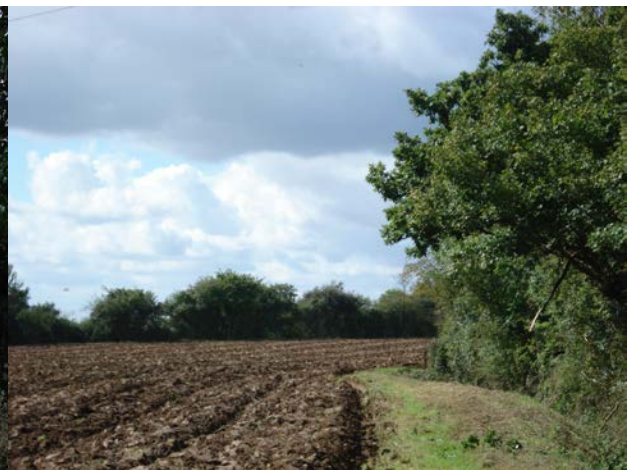
At the waymarker, turn left across field

Head for the corner of the hedge (AM). It is not always restored, but a way across can usually be seen.