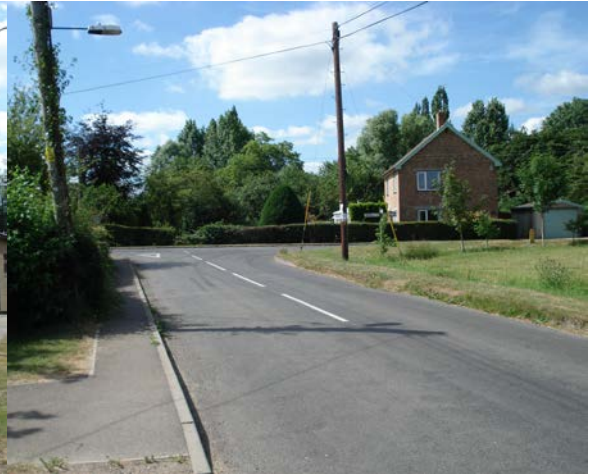
View from Scout Hut to end of road (AF)

Turn right and proceed to the footpath sign on the left opposite the red phone box (AG).