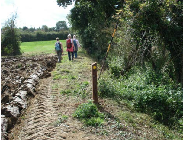
Waymarker and into meadow

Continue along the field edge past the way marker and into an open meadow. Head diagonally left across meadow to bridge (AN). Cross bridge (This is now right of way 49 on definitive map).