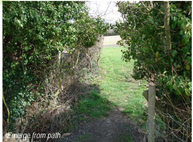
Emerge from path

Head along track and turn left at Old Mill House. Follow the track to the road (AQ). Turn right on the road and return to the Scout Hut.