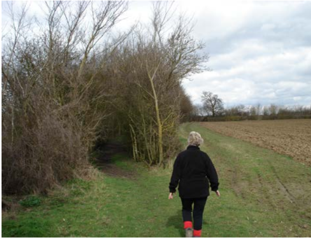
Hedge-lined sunken lane

Some distance after the second bridge, the byway becomes a hedge-lined sunken lane and is clearly marked. Take this.