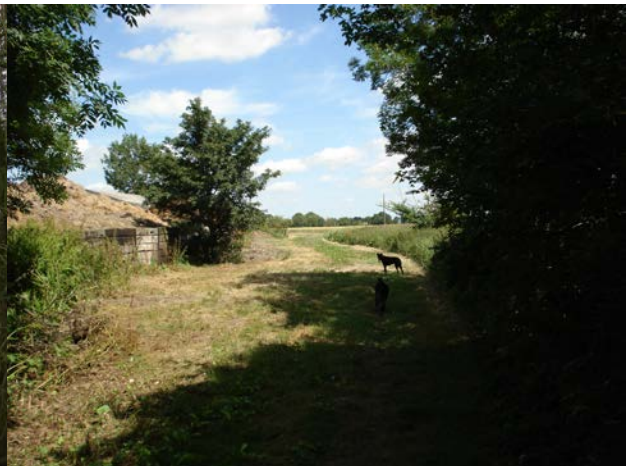
Byway alongside Redhouse Farm to road (AJ)