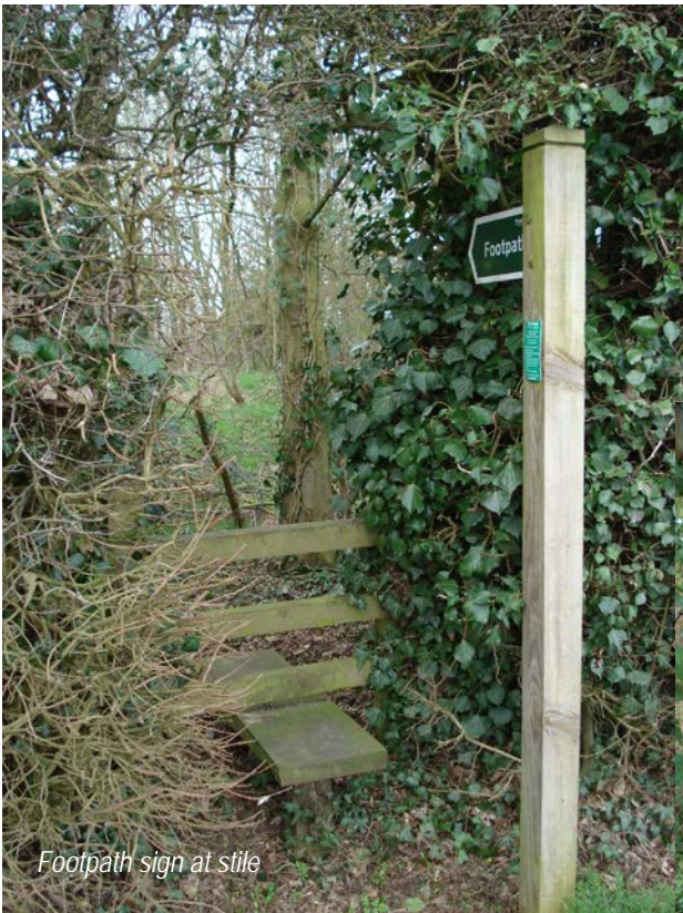
Footpath sign at stile

After a short distance on this road (AK), there is a footpath sign on your right. Cross the stile and take this footpath (This is right of way 52 on the definitive map).