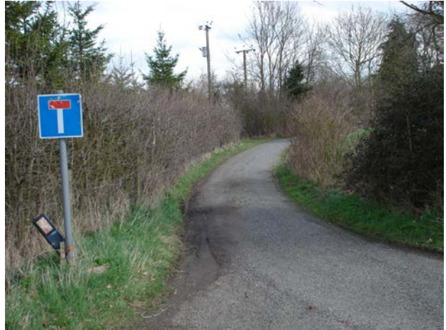
No through road sign at start of Wimble Lane

Follow Wimble Lane, past Wimble Cottage, until you reach the road (F).