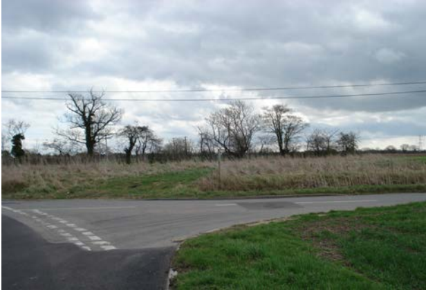
Road junction (T) going towards Mendlesham Green

After a short distance on this road (AK), there is a footpath sign on your right. Cross the stile and take this footpath (This is right of way 52 on the definitive map).