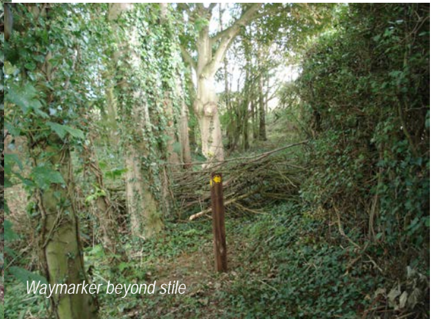
Waymarker beyond stile

After crossing the stile, turn right along the line of the hedge. At the way marker, turn left and head towards the way marker.