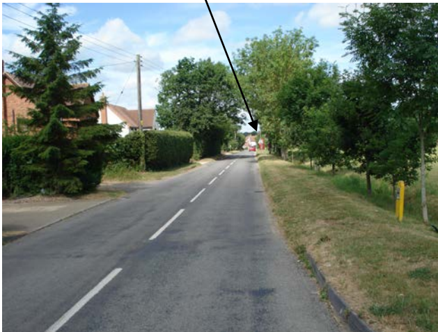
View from corner of road (AF)

Turn right and proceed to the footpath sign on the left opposite the red phone box (AG).