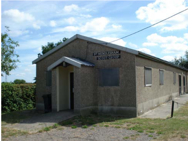
Mendlesham Green Scout Hut

Start at Mendlesham Green Scout Hut (START). Turn left out of the scout hut and proceed to the end of the road (AF). Or Park at the Community Centre and walk through the Vicarage Plantation to point D White up's lane, following the last section of the walk first and returning back the same way.