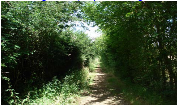
Continuation of byway

Cross the road and continue along the byway crossing two bridges. After the first bridge the byway curves right.