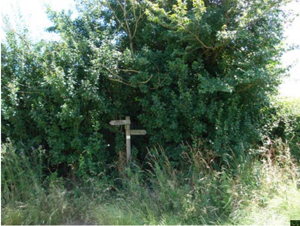
Footpath sign at end of path adjacent to children's play area

Follow this path with gardens and houses on your right. Turn right and emerge from the path onto the lane (AP). Turn right.