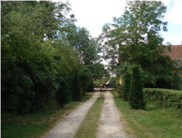
Footpath towards Cherry Tree Farm