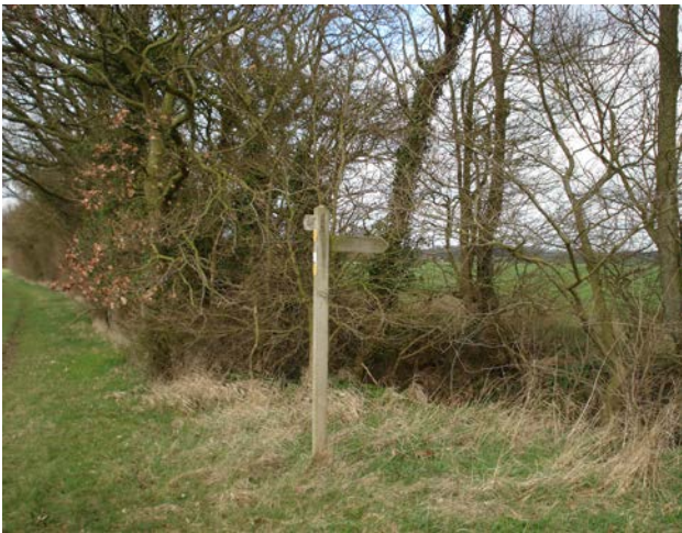
Footpath signs along Old Hundred Lane on way to Palgrave Farm