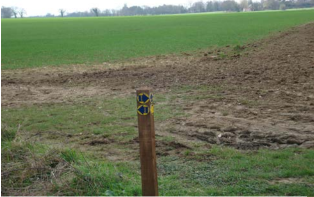
Way marker at Old Hundred Lane

Follow the bridleway keeping to the left of the hedge. Go past the footpath sign to your right until you reach Palgrave Farm . There are two footpath signs to your right along your way. The last one is just before reaching Palgrave Farm . (These mark rights of way 36 and 38 respectively).