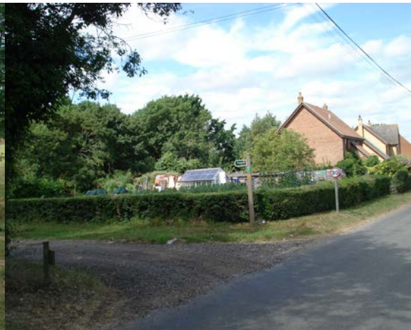
Footpath sign (AG)

Turn left and take the path labelled Cherry Tree Farm (This is right of way 34 on definitive map). Head towards the wooden gate at the side of the farm house. Just before the gate, turn left. Pass through the kissing gate and follow the field edge to the field corner.