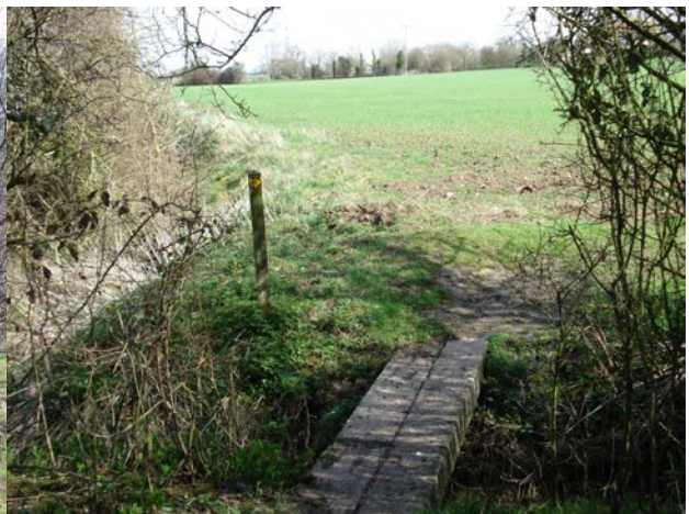
Bridge and waymarker

Continue to the end of the path (AO) with the Mendlesham Green children's play area on your right. Turn left at the hedge (this is right of way 50 on the definitive map) and follow the fences along the bottom of gardens.