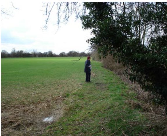
Follow field edge

Follow the field edge to the way marker where the field edge turns 90 degrees to the right. At this point (AL) turn 90 degrees to the left and head directly across the field.