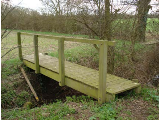
First bridge (second bridge visible on right)