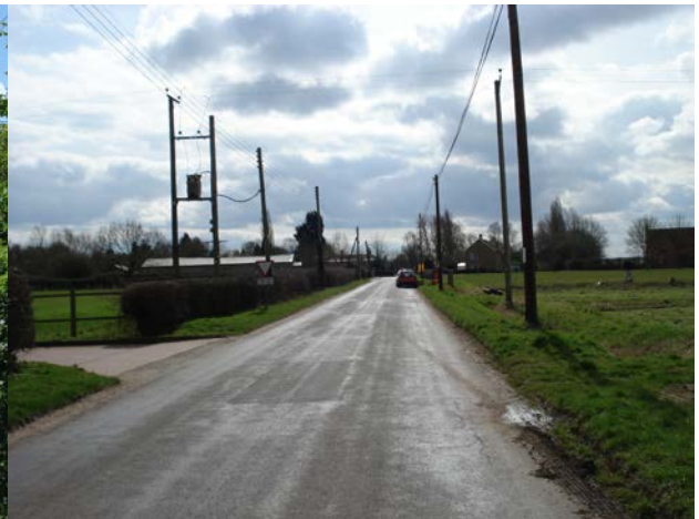
Road back to Scout Hut