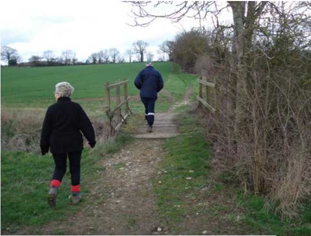
Bridge along Old Hundred Lane

Cross over a bridge and continue walking until meeting the road (AI).