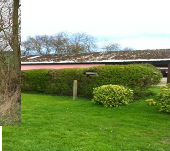
Bridleway to the left of the hedge