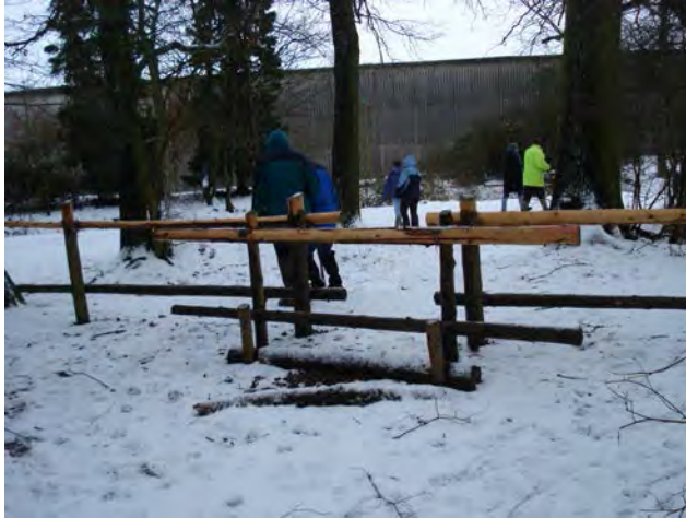
Exit from Vicarage Plantation through parallel fencing (B) in the winter

Exit the plantation (B) through the parallel fencing and across a ditch opposite the grain store. Turn right. (This is right of way 61 on definitive map).