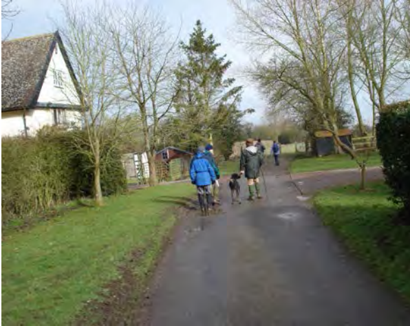
Road through Tan Office

On emerging at Tan Office, turn left along the road before passing through a gate to join the bridleway. (This is right of way 14).