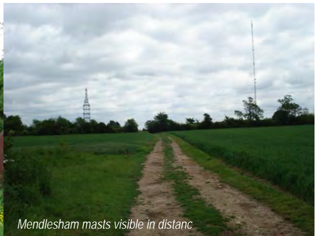
Mendlesham masts visible in distanc

Turn left and follow Babb's Lane (this is right of way 15) until you reach the private part of Babb's Lane (AA). The continuation of the footpath is blue to your right.