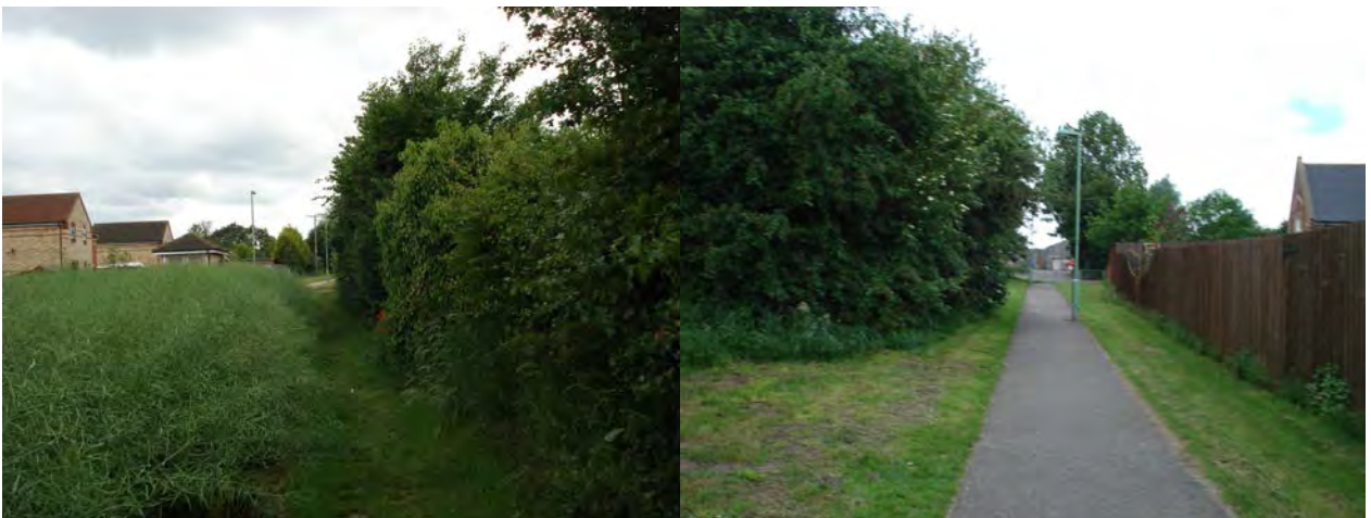
Footpath to Glebe Way

Turn left at the footpath sign. (This is right of way 58 on the definitive map). Follow the footpath with the hedge and gardens on your right. Cross Glebe Way (AD) and then follow tarmac path to reach the main road at the St Joseph's Centre (AE). Turn right and return to the Community Centre