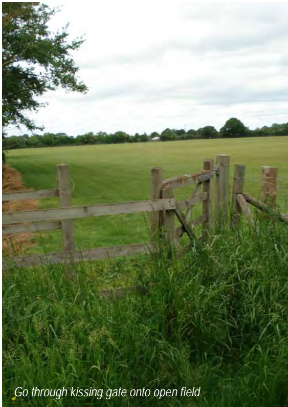
Go through kissing gate onto open field

Follow the footpath. This involves passing through a kissing gate onto an open field with farm buildings on your left. Follow the field edge until you come to a made-up driveway. Follow this. This involves crossing a farm road. Then take a sharp left turn (AB) and pass through a gate to emerge at the junction of Wash Lane and Oak Farm Lane. Turn right.