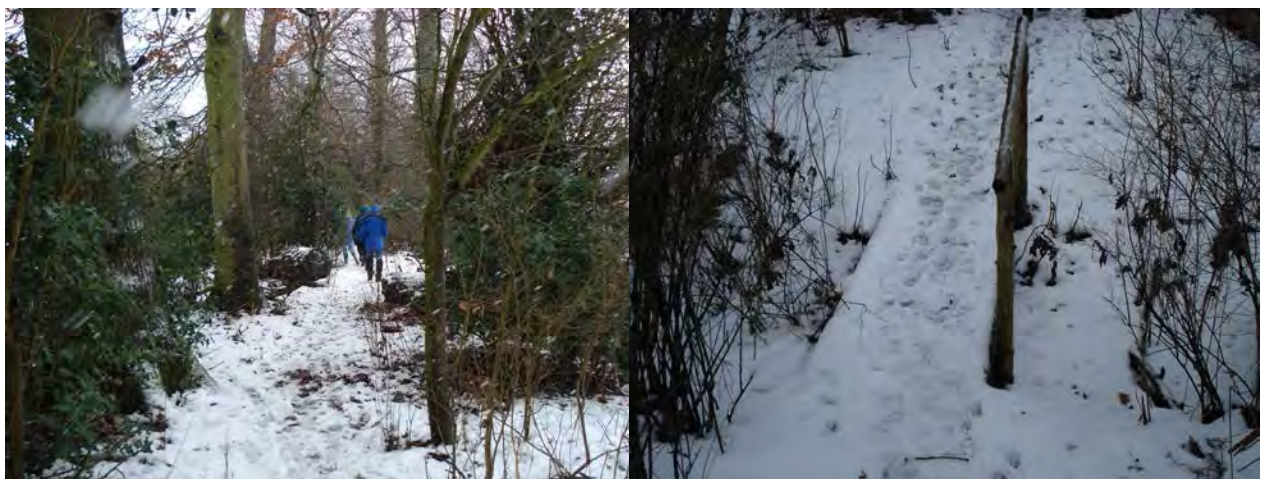
Woodland walk around Vicarage Plantation – showing one of the wooden bridges (winter)