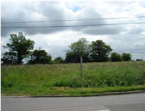
Footpath sign (E)

At the corner where the road turns to Mendlesham and there is a junction to Mendlesham Green (T), there is a footpath sign on the other side of the road. Take this path towards the white house (Kersey's Cottage), then follow the field edge on your left. Proceed under telephone and electricity wires. Just after the electricity wires, cross into the next field over a wooden bridge.