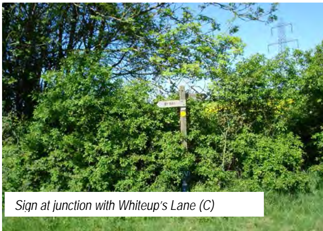
Sign at junction with Whiteup's Lane (C)

There is an excellent sign here. However, if you approach from the north, there is no way marker pointing down right of way 61 towards the grain store.