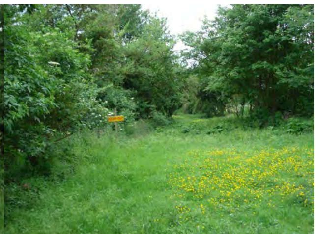
Private part of Babb's Lane