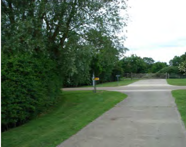
Follow this drive crossing farm road