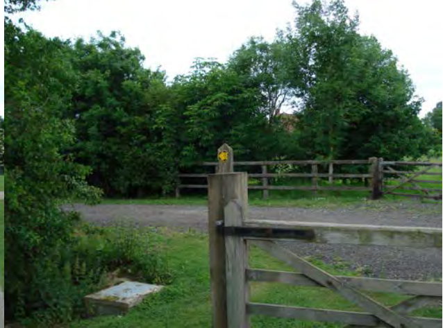
Sign showing left turn