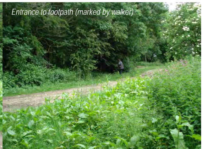
Entrance to footpath (marked by walker)