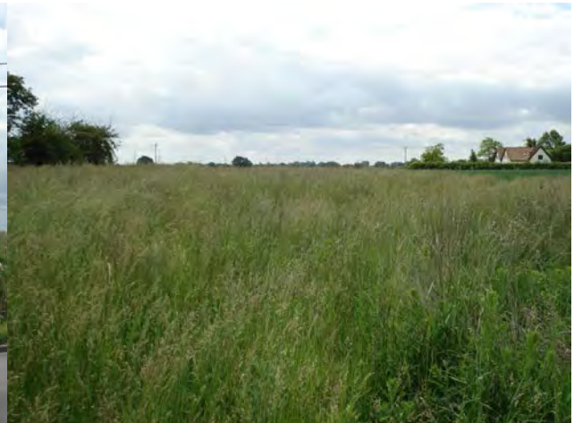
View towards field edge from footpaths sign