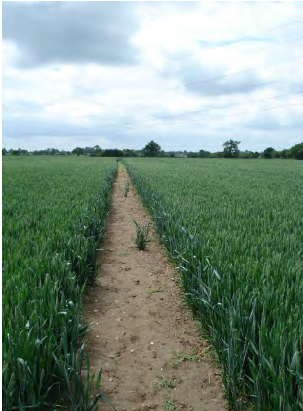
Cross the field, aiming to the left of prominent tree

Turn right and head directly across the field, under the electricity cables, Aim just to the left of a prominent tree. (This is right of way 20 on the definitive map). At the hedge line, there is a bridge (V) leading to the next field.