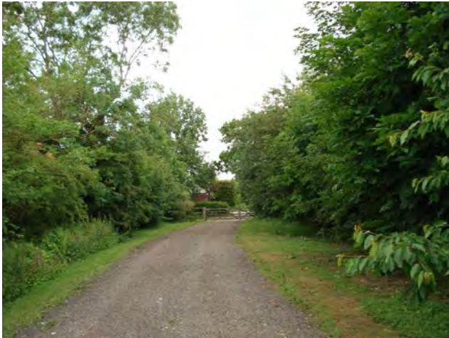
Gate to Wash/Oak Farm Lanes

Although there is a footpath sign from Wash/Oak Farm Lanes, it is not very clear that you have to go through the gate.