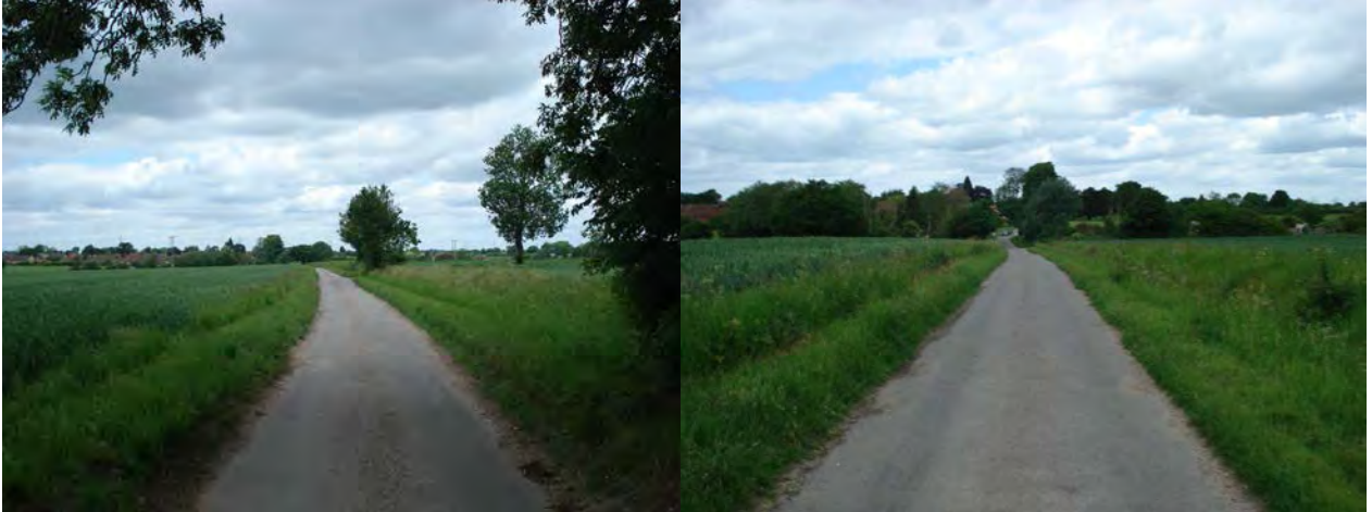
Views along Oak Farm Lane

Continue to proceed along Oak Farm Lane until this road enters Mendlesham village (AC).