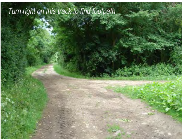
Turn right on this track to find footpath

Proceed along the bridleway until you see a track to the right. Take this. There is a footpath sign on your left (Y) (this is right of way 14A). Follow this path until you emerge on Babb's Lane (Z). It starts in a wooded area, then turns left along a track which passes a farm on your left. Follow the track away from the farm with Mendlesham masts visible in the distance.