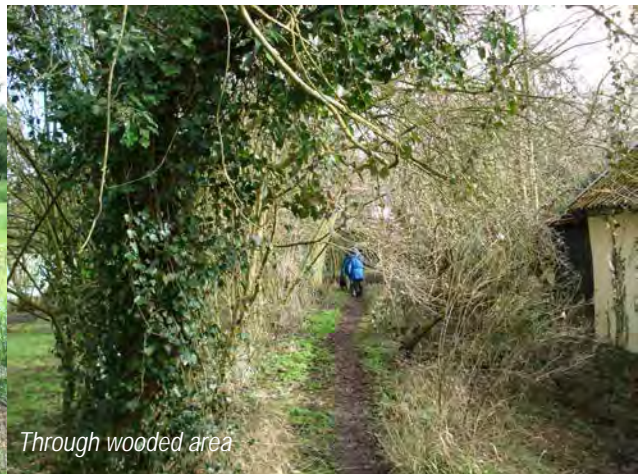
Through wooded area