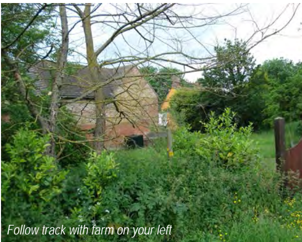
Follow track with farm on your left