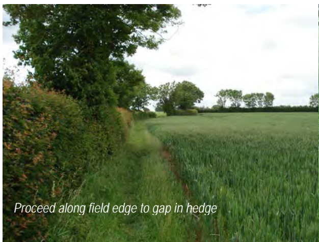
Proceed along field edge to gap in hedge

Continue along the field edge to the way marker in the gap in the hedge (W). (The final part of this is right of way 31.)