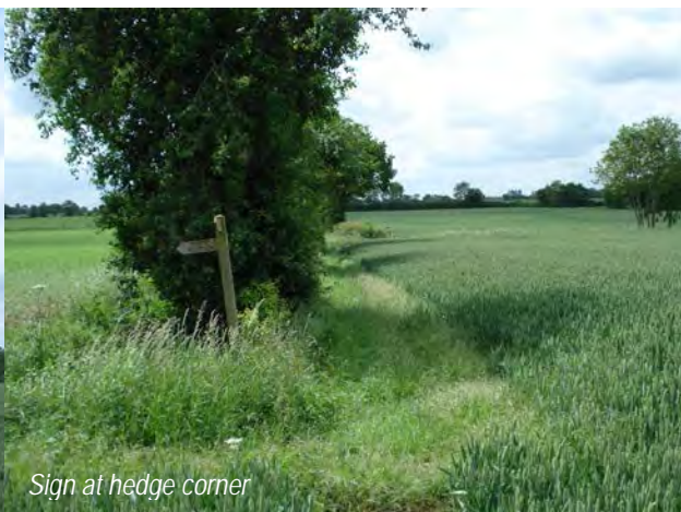
Sign at hedge corner