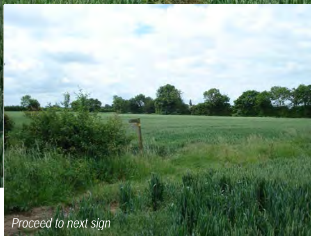
Proceed to next sign

Continue along the field edge to the way marker in the gap in the hedge (W). (The final part of this is right of way 31.)