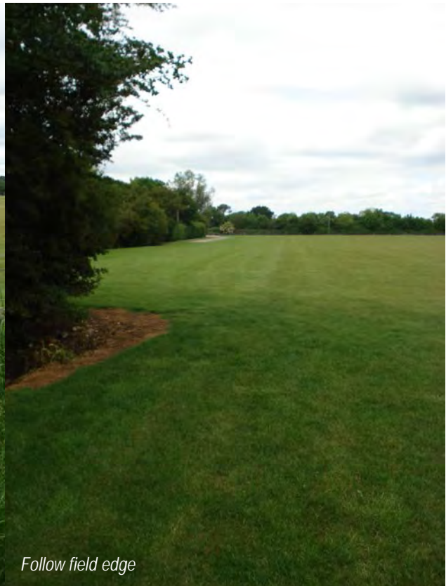
Follow field edge