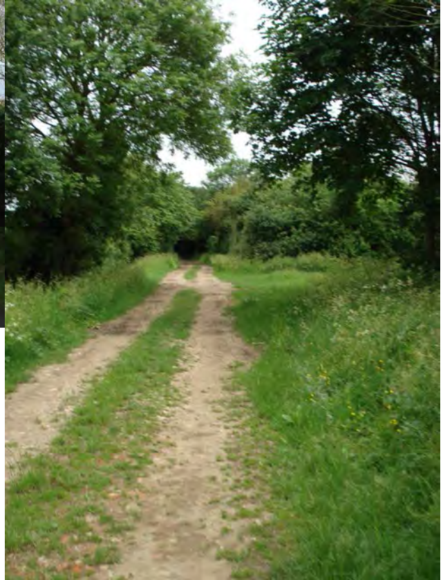
View along bridleway

Proceed along the bridleway until you see a track to the right. Take this. There is a footpath sign on your left (Y) (this is right of way 14A). Follow this path until you emerge on Babb's Lane (Z). It starts in a wooded area, then turns left along a track which passes a farm on your left. Follow the track away from the farm with Mendlesham masts visible in the distance.