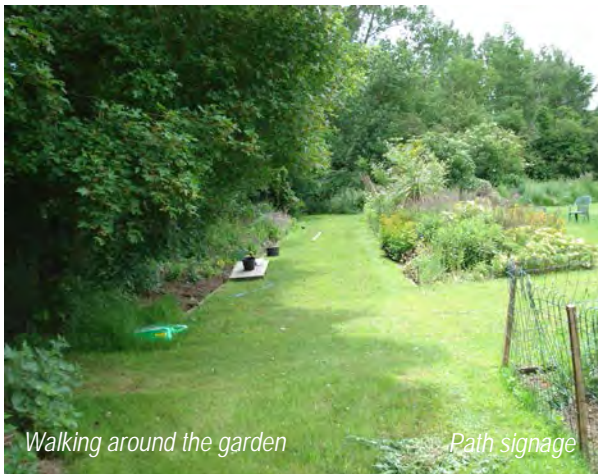
Walking around the garden

Follow the way markers through this garden, taking the second path on your left by the way marker. You pass through a very pretty wooded area and the path runs along the side of the house before emerging in Tan Office (X).