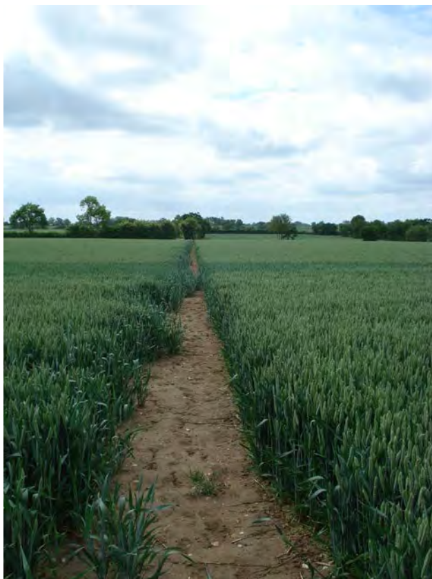
Cross the field, aiming for the hedge corner