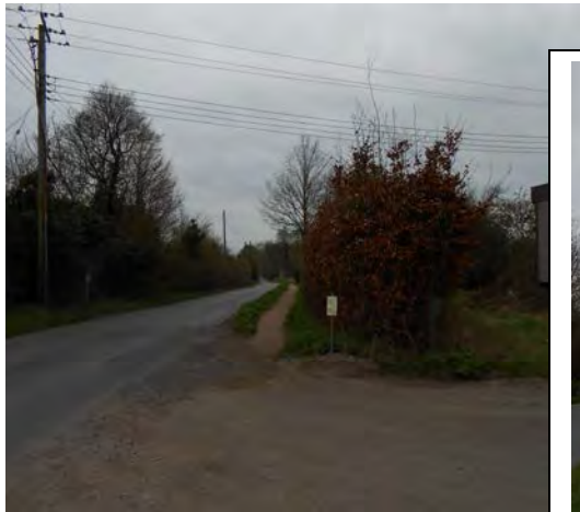
View from school towards Vicarage Plantation – St Joseph's on left

This route runs along a busy road and is potentially hazardous. In 2013 it was improved by the addition of the footpath leading to the vicarage plantation. It begins just after the grass verge