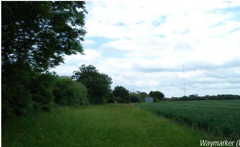
You can see the Mendlesham mast

There is a grey barn and a farmhouse (Grove Farm) just beyond the way marker . (This route comprises rights of way 21 and 29 on definitive map).