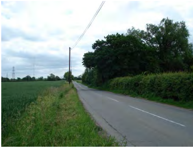
View along road from Whiteups Lane (D)

Continue along this track until you meet the road (S). Turn left and walk along the road.