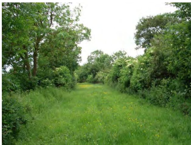
View along Babb's Lane

Turn left and follow Babb's Lane (this is right of way 15) until you reach the private part of Babb's Lane (AA). The continuation of the footpath is blue to your right.